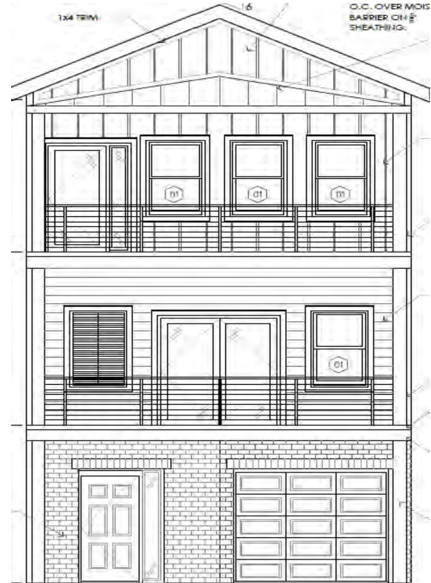
04 EXTERIOR ELEVATION (FRONT) A2.01 SCALE: 1/4" = 1'-0"