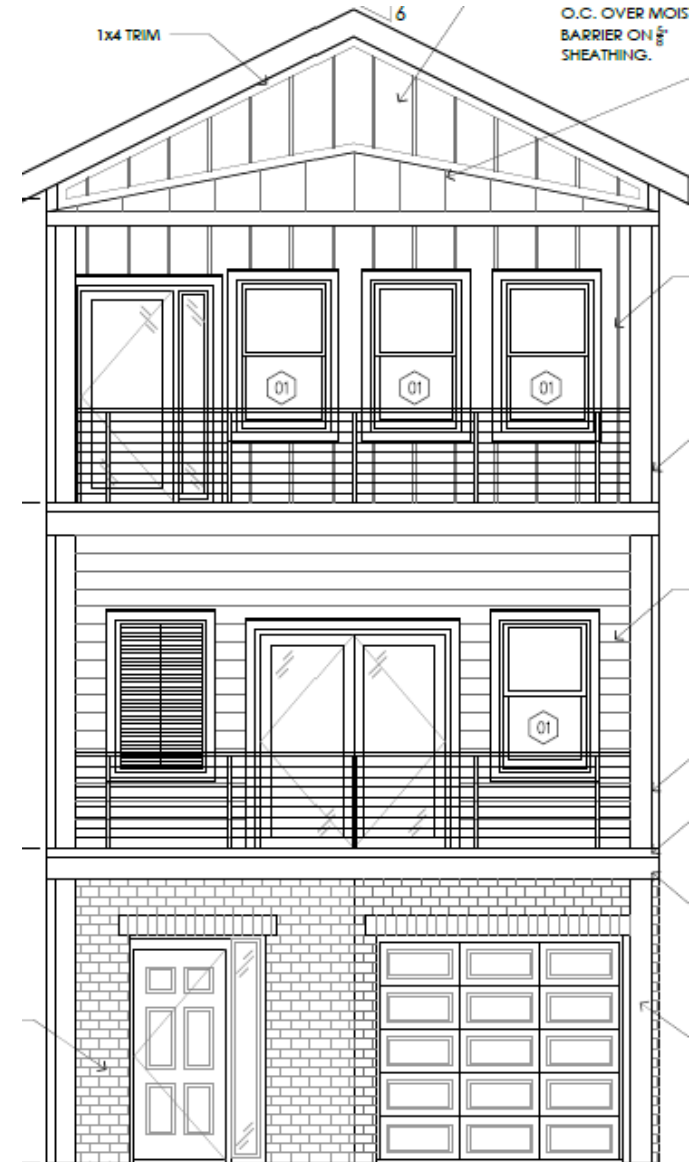
04 EXTERIOR ELEVATION (FRONT) A2.01 SCALE: 1/4" = 1'-0"